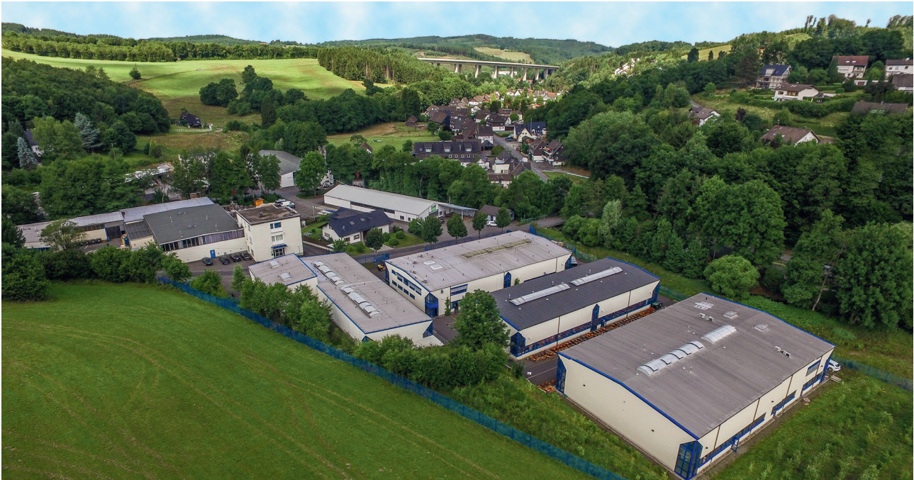
> Aerial view of the company premises in Reichshof

High-Quality valves for industrial applications and energy production