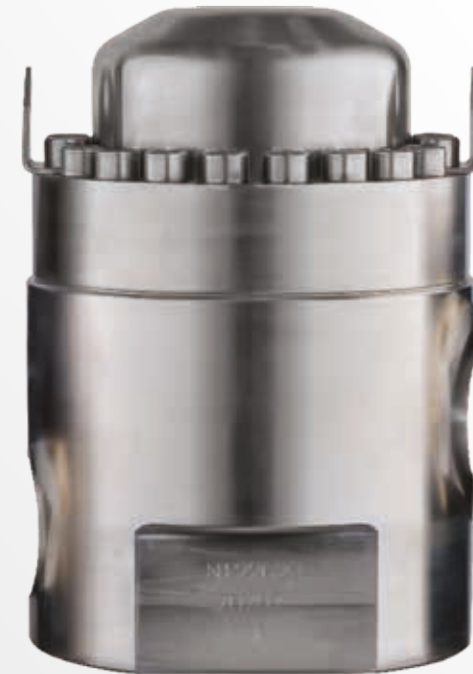
RH65 – DOME LOADED REGULATOR