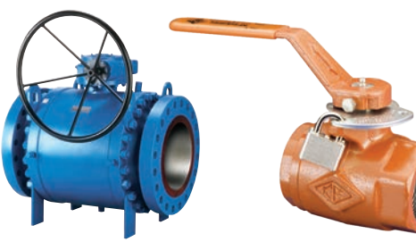
Trunnion Mounted Ball Valves