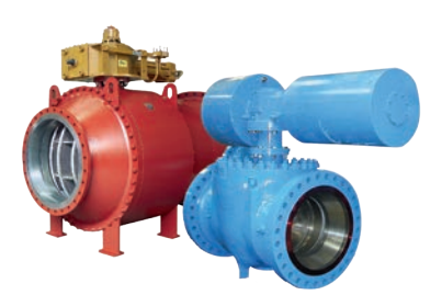
Engineered Ball Valves