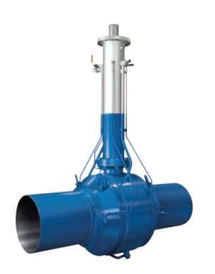
Welded Body Ball Valves