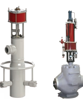
Severe Service Control Valves