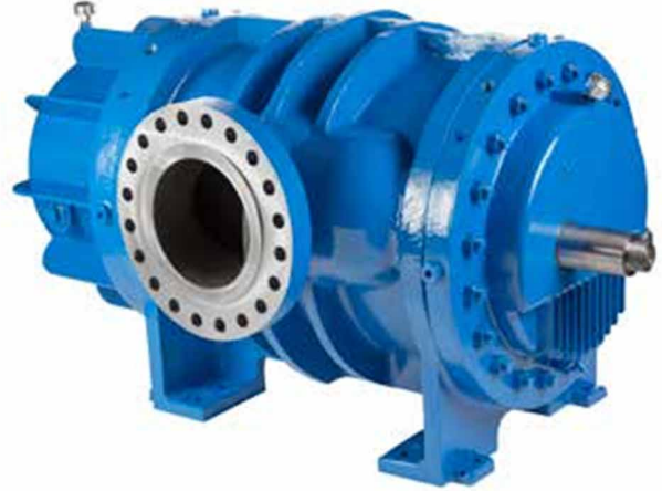
FSXB SERIES TWO-SCREW PUMP

The FSXB is suitable for a host of applications within the production and transportation segments of the Oil and Gas market including platforms and pipelines. It is available in a variety of materials, including cast and stainless steel, to meet your specific requirements (i.e. NACE).